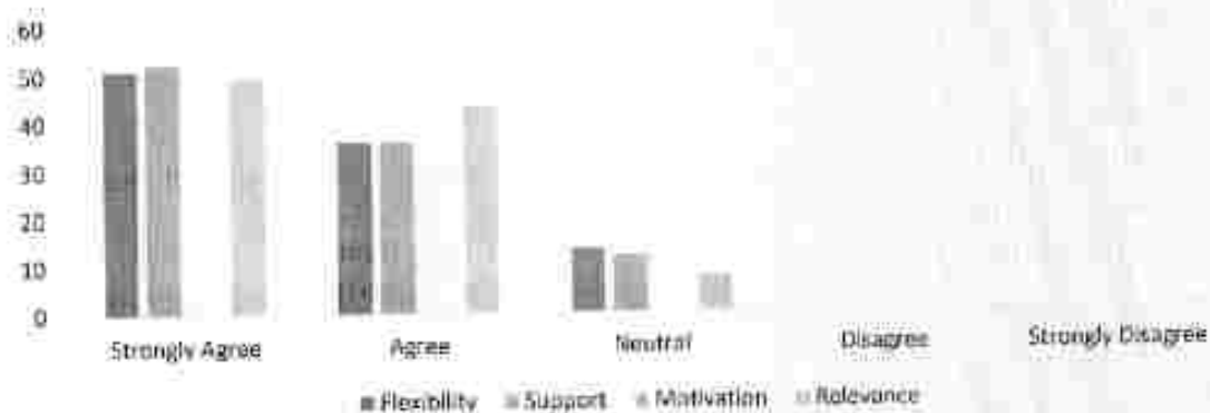
Teacher's Feedback for A.Y. 2020-2021